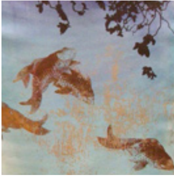
Fish in Stream

Size: 550mm x 800mm Media: Hand Coloured screen print on hand made paper $130